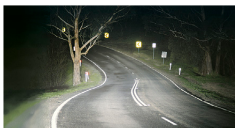
Plus 150 globes