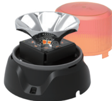
Improved circuitry and L.E.D chips