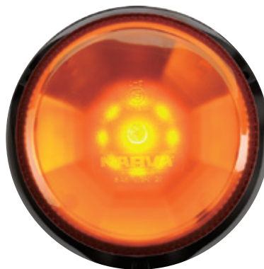
Single Upward Facing High Powered L.E.D providing upward illumination