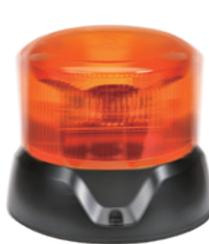
Vibration tested to military specification

These upgrades allow Narva to offer an incredible and market-leading 10 year warranty on Pulse II strobes.