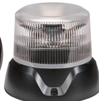
Clear lens also available (P/No.85246AC)