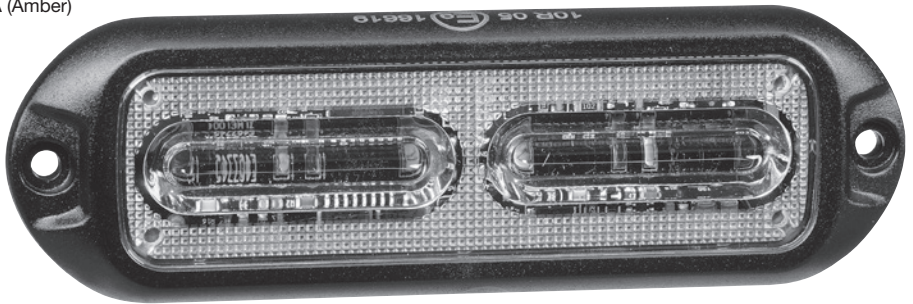
P/No. 85221RB (Red/Blue)