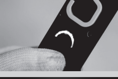
Heavy-duty mounting magnet