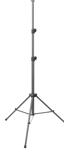
Part No. 71470