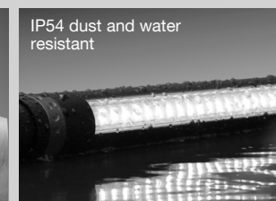
IP54 dust and water resistant