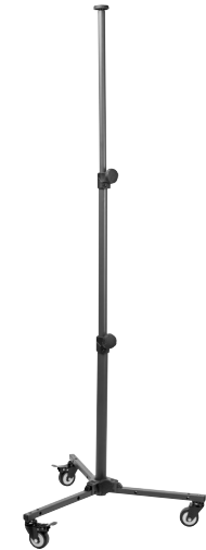
Part No. 71472

Adjustable height from 1.3 - 3m Use with 71486 to hang the Under Bonnet / Scene Light