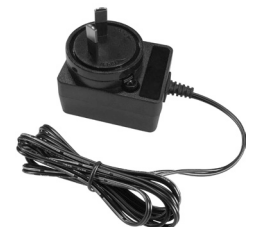
Part No. 71430