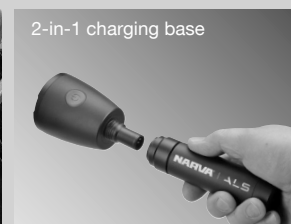
2-in-1 charging base