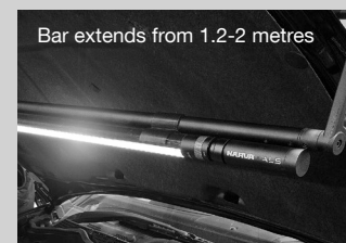
Bar extends from 1.2-2 metres