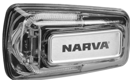
P/No. 93210 Chrome with Amber Lens