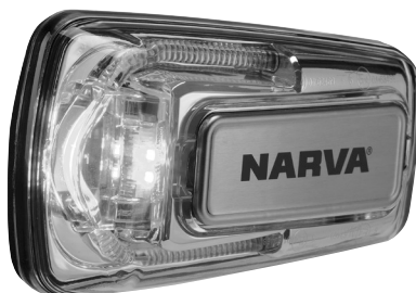
P/No. 93212 Chrome with Clear Lens