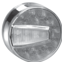
P/No. 954006 (right hand unit)