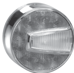
P/No. 954004 (left hand unit)